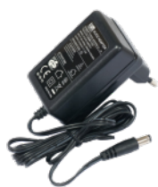
24V 0.8A power adapter